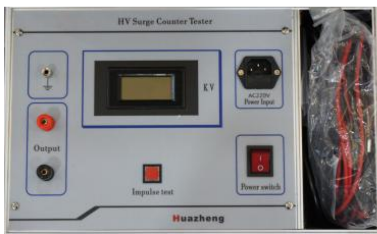
Fig. 3 Schematic diagram of detector panel