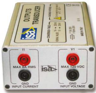
Output transducer module

The items can be ordered separately: the Output transducer alone, or also one cable or both.