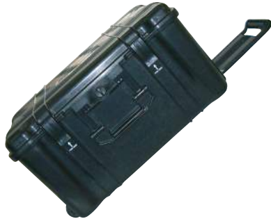
Heavy duty transport case

Heavy duty transport case in black plastics, with wheels, cover and handle.