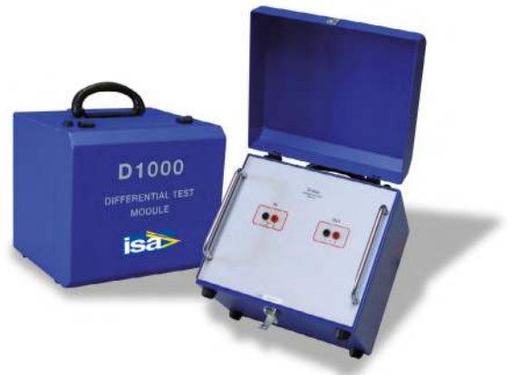
D 1000 Differential relay test module