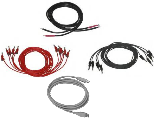
T 1000 PLUS - Standard cable kit

The kit includes cables for any kind of connection.